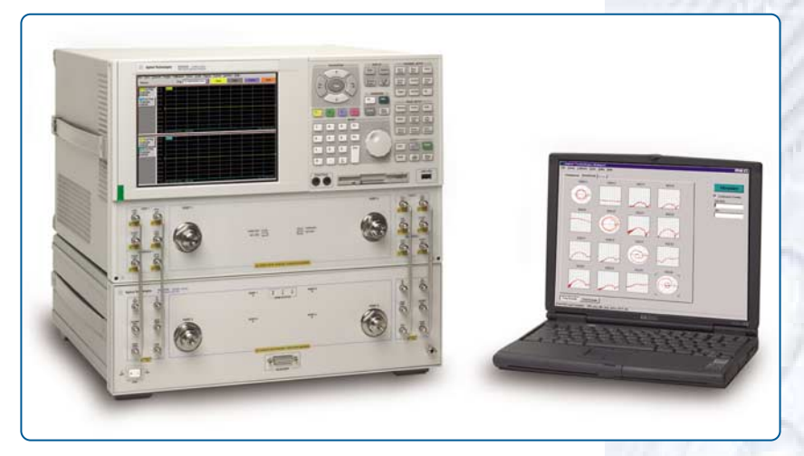
Microwave PNA series network analyzer with N4421A 50 GHz test set

While ideal balanced components only respond to or produce differential (out-of-phase) signals, real-world devices also respond to or produce common-mode (in-phase) signals. Agilent's balanced-measurement test systems perform a series of single-ended stimulus/response measurements on all measurement paths of the device under test, and then calculate and display differential mode, common-mode, and mode conversion S-parameters.