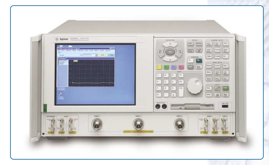
PNA series RF network analyzer with built-in third test port

Rapid and continuous changes in RF and microwave technology present a growing challenge for designers and manufacturers. The Agilent PNA Series is a measurement platform that meets the challenge with the right combination of fast sweep speeds, wide dynamic range, low trace noise, and flexible connectivity. Test your high-performance components with a fast and accurate network analyzer that meets your measurement need now and well into the future.