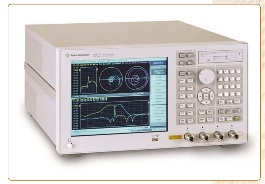
ENA series RF network analyzer with four built-in test ports

New-generation wireless equipment depends on advanced RF components, from duplexers and couplers to differential SAW filters and amplifiers. These components need to be measured efficiently in R&D and production process. Fast and accurate testing is crucial, and Agilent's ENA series network analyzers offer comprehensive measurement capabilities for advanced multiport devices.