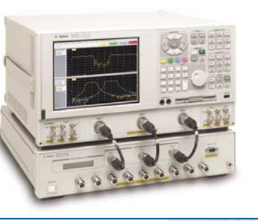
PNA series network analyzer with Z5623A H39