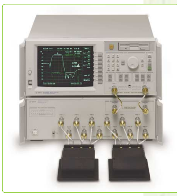
8714ES with 87050E multiport test set

If frequency transition devices such as mixers and up/down converters need to be measured along with duplexers or filters, Agilent 8753ES is an appropriate solution. An 8753ES provides mixer measurements and harmonics measurements (Option 002), while Option H39 adds a third port to a two-port analyzer that enables single connection measurements for all necessary paths of up to three-port devices.