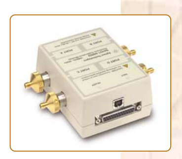
Four-port RF ECal with four 3.5 mm connectors

The Agilent E5091A multiport test set, combined with the four-port ENA series network analyzer, is a complete solution for multiport device measurements. The multiport test set is available in seven and nine-port configurations. The system is tailored for testing the antenna switch modules for mobile handsets, particularly those modules with balanced ports, although it can be used in a wide range of multiport measurement applications. The system is well suited for both manufacturing and R&D with exceptionally fast measurement speed and various features that facilitate test automation.