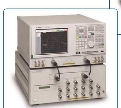
PNA series network analyzer with 87050A H16