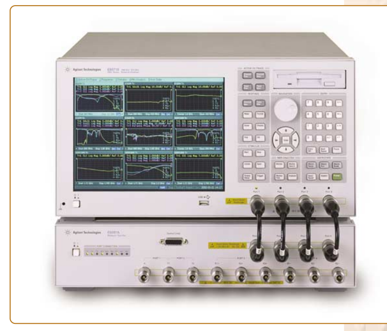
ENA series RF network analyzer with E5091A multiport test set