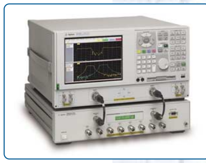
PNA series network analyzer with Z5623A H48

Many of today's wireless communications and broadband components have three or more ports. These components require multiple connections for complete characterization with a network analyzer. However, time-to-market pressures require that today's components be tested quickly while maintaining high levels of accuracy and high repeatability to achieve production volumes.