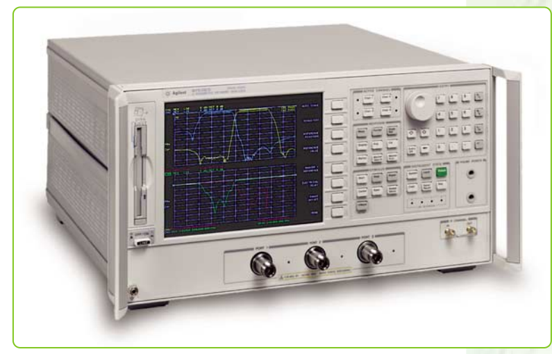
8753ES option H39/006